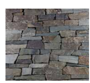
Pennsylvania Weathered Edge