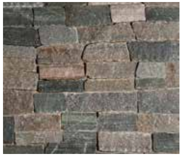
New England Blend