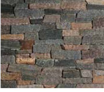
New England Blend