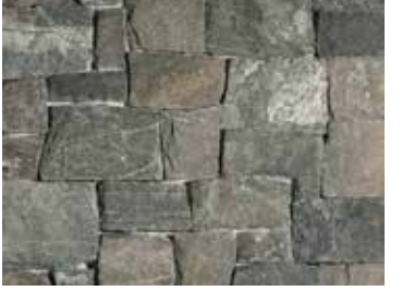
Connecticut White Line