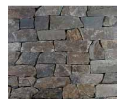
Pennsylvania Weathered Edge