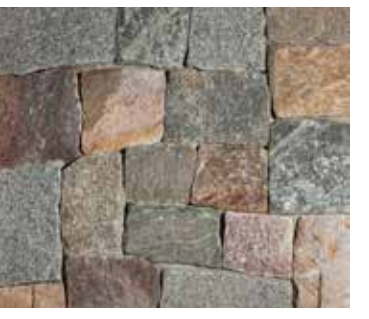
New England Blend