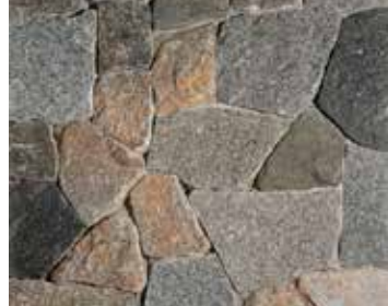
New England Blend