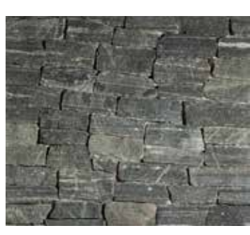
Connecticut White Line