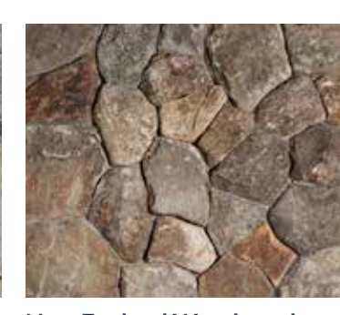
New England Weathered Fieldstone