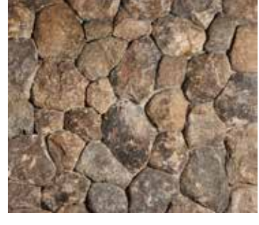
New England Weathered Fieldstone

Finish: Natural Size Range: 8" – 16" Diameter