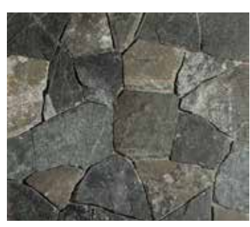
Connecticut White Line