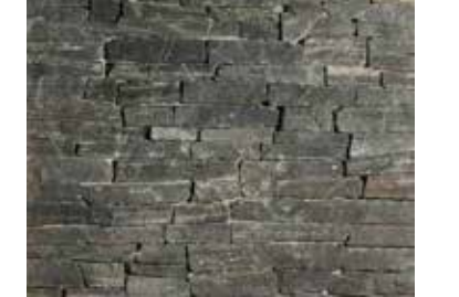
Connecticut White Line

Finish: Split Face Length: 4" - 12" Height: 1" - 4" Thickness: 1 ½" +/-