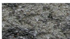
Granite City Blend