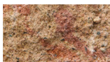
Crab Orchard Blend