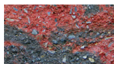
Fire Island Blend