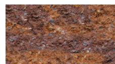
Golden Brown Blend