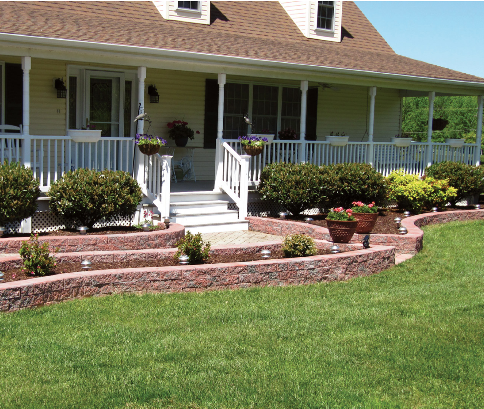
Serafina Wall | Color: Fire Island Blend