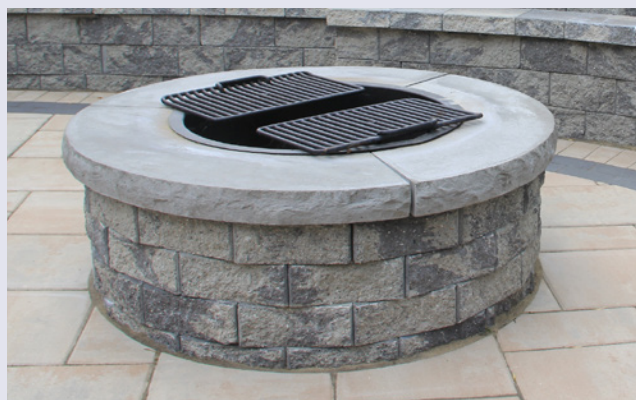
Serafina Fire Pit | Color: Granite City Blend

Use our Serafina Wall to build a Fire Pit, or purchase one of our pre-packaged Fire Pit kits to complement your wall.