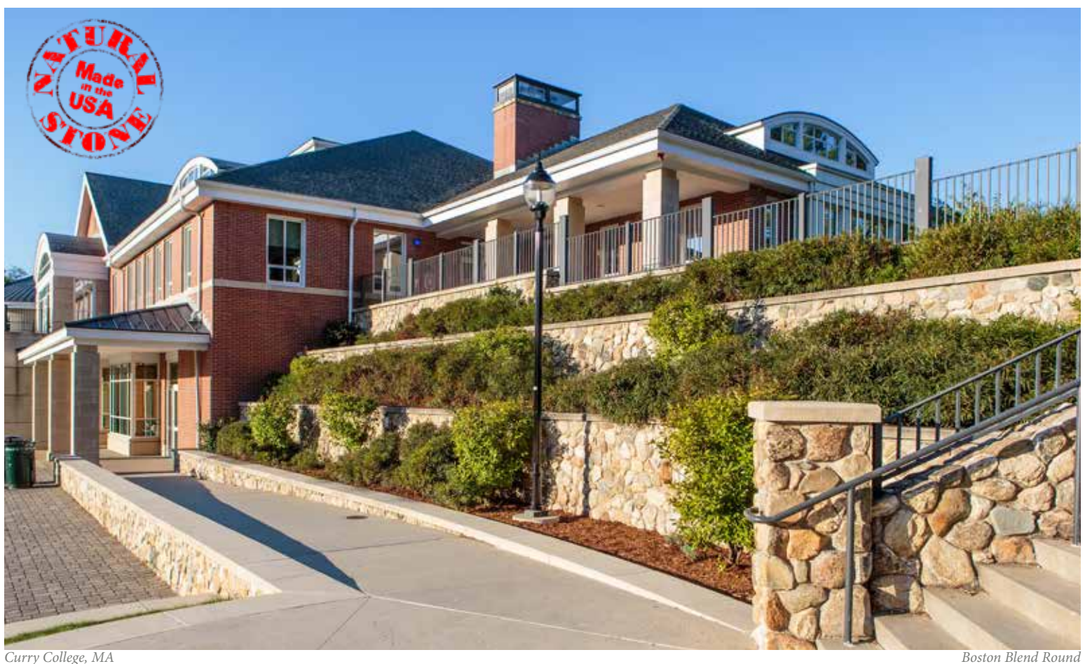
Curry College, MA