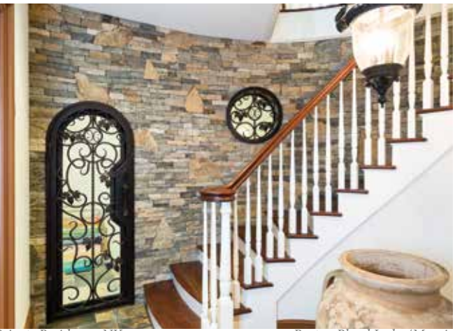
Private Residence, N